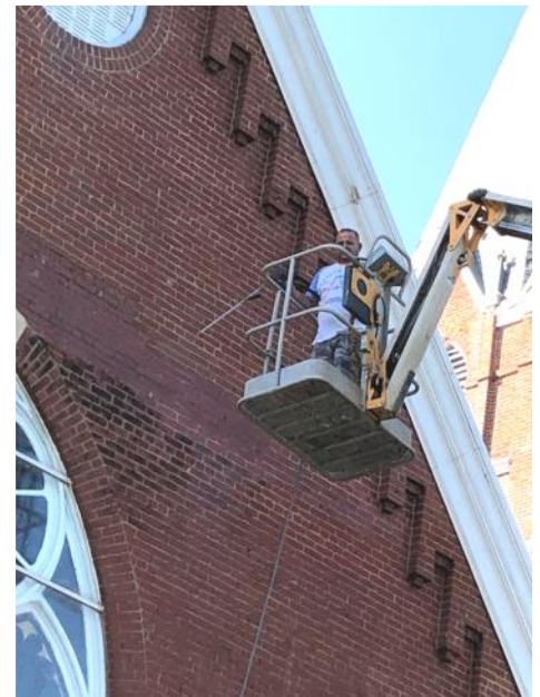
▲ Tuckpointing — this project is nearly complete!