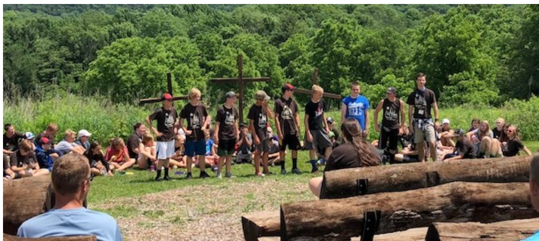
Seventh grade students from Trinity attended Confirmation Camp at Good Earth Village. They had a great week of fellowship, Bible Study, music, outdoor activities, and making of new friends!

IMBA SIFA—SING PRAISE! Imba Sifa-Sing Praise! Is an opportunity for musically inclined young people to visit Tanzania and link up with young musicians from the Central Diocese. They will learn music here before the trip, and then while they are abroad, they will learn music with Tanzanian young people and visit several communities in the Central Diocese. Minimum age limit is 16. An information session is Sunday, July 8 at 6:00 p.m. at Trinity Lutheran in Owatonna. For more information and an application to become a part of this team visit, http://semensynod.org/tanzania .