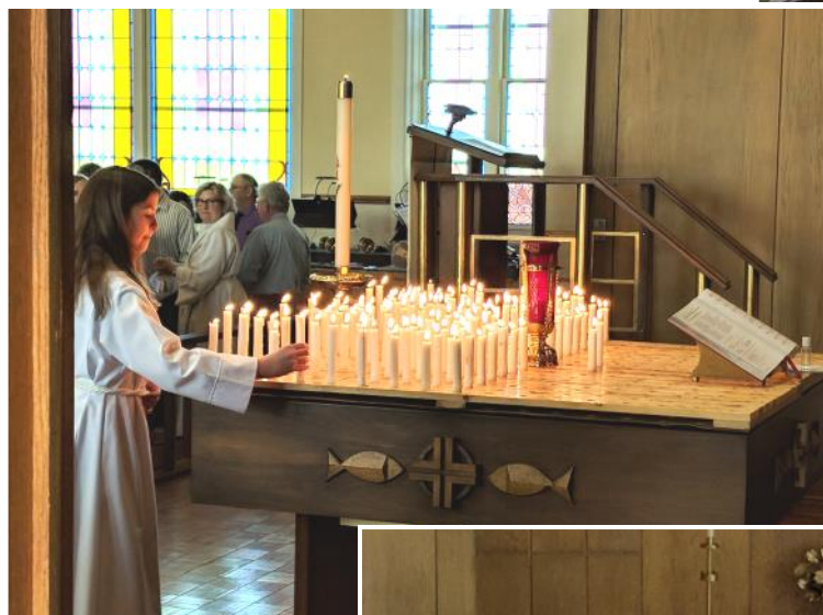
◀ ▼ All Saints Worship on November 3.