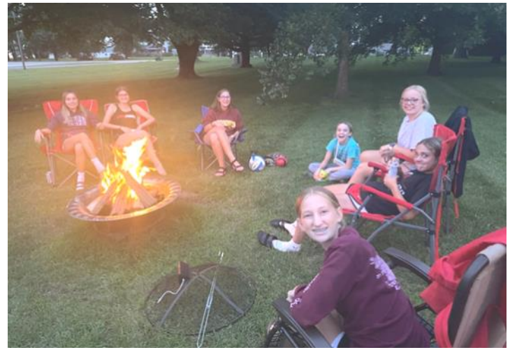
▲ Enjoying Wednesday evenings under the stars at bonfires was enjoyed by many 8 th -10 th graders this summer.