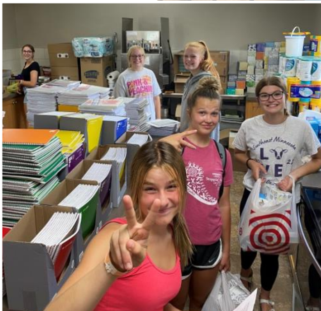
◀▼ Thank you for the generous donations and volunteering for the Helping Hands School Supply Drive! Our youth helped and the Outreach Team coordinated and delivered supplies. Many families were given a boost for a great start to the school year!