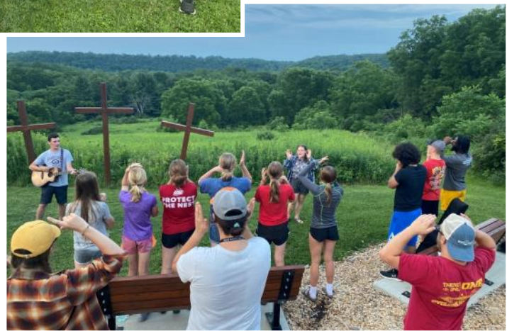
▲► Seventh graders spent a week at the beautiful Good Earth Village for Confirmation Camp.