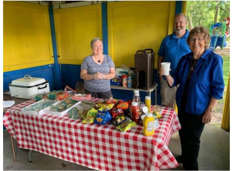
Outdoor worship at Trollskogen Park with a meal following served by the Stewardship Team. It was a beautiful (and delicious!) morning!! Thank you to all who made this service and meal possible!