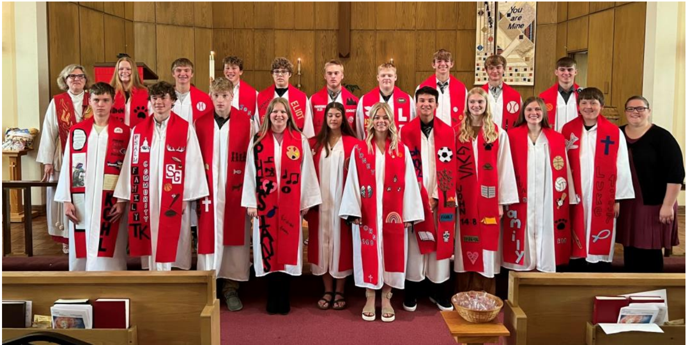
▲ Our Confirmation class of 2022