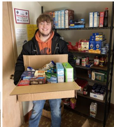
LITTLE FREE PANTRY DONATION Thank you Spring Grove Communications and the community for the food donations to our Little Free Pantry.