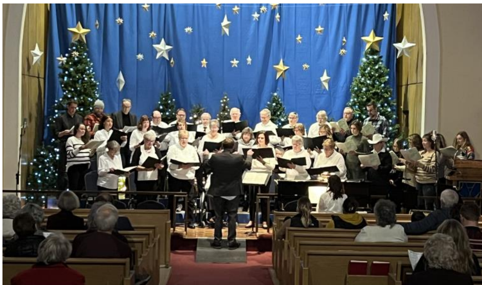
CHRISTMAS CONCERT Thank you to the vocal choir, handbell choir, Thankful Brass, instrumentalists, soloists, choir alumni — everyone who made our concert a beautiful evening of music!