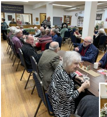
150TH BIRTHDAY OF OUR BUILDING Delicious treats were enjoyed by many!