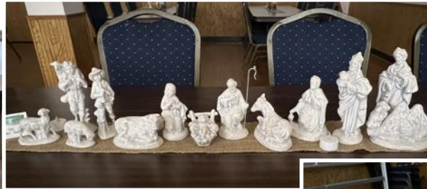
NATIVITY SCENES Thank you to all who loaned us their nativities for the season. You can see these and many more through January 7 in the Fellowship Hall.