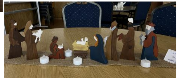
CHRISTMAS PROGRAM A beautiful, sweet, entertaining Sunday School Christmas program! Thank you to all who made this possible.