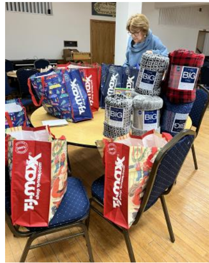
CHRISTMAS CHEER PACKAGES Thank you to our Care Team for organizing and packaging the 54 Christmas Cheer packages for families in Spring Grove.