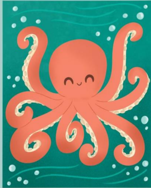
ORIENT YOURSELF IN SPACE & TIME