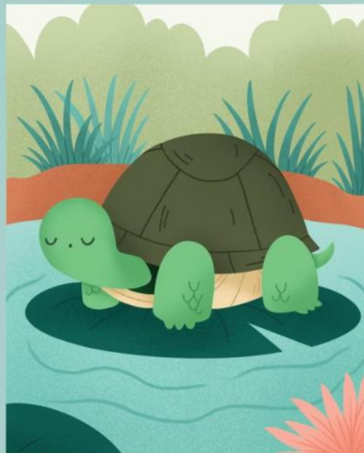
THROW STRESS AWAY