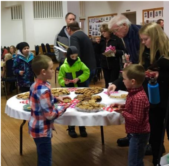
The Great Chocolate Chip Cookie Extravaganza!