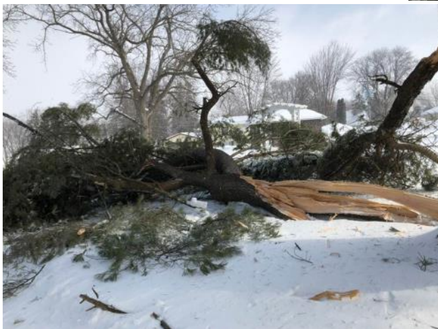
The ice and snow from the storm of February 23/24 was too much to bear for a tree near the parsonage.