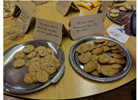
Treats before the Annual Meeting. ▲