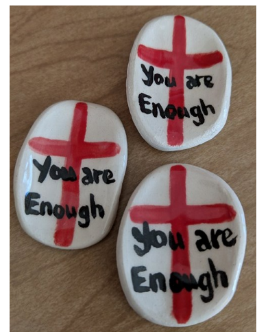
Prayer pebbles given out at worship to remind us that even though our culture may say we don't measure up, in the eyes of God, "We are Enough!" ▲