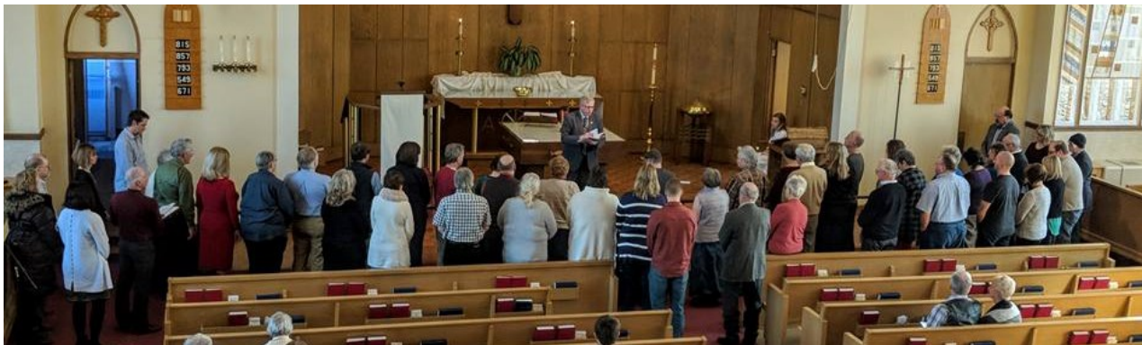
Many of our Team Members and Leaders and Endowment Members. ▲