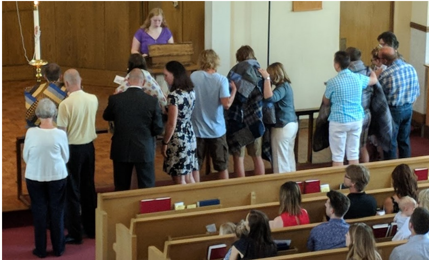
▲ Blessing of our high school graduates. ▼