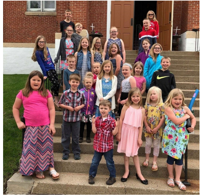
▲ We had a great Sunday School year! Thanks to all the teachers and shepherds!