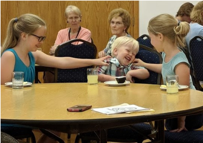
▲ Big sister tickles during Fellowship are the best!