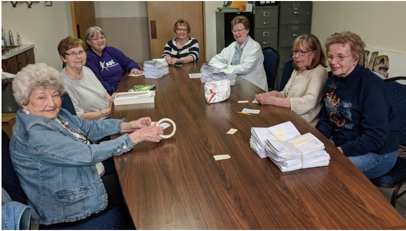
▲ These wonderful, joyful ladies gather each month to help prepare the newsletter for mailing. Thank you!