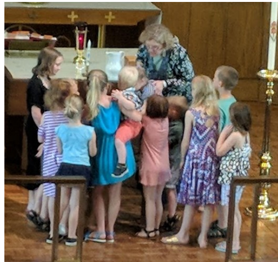
Learning about baptism during Children's Time.

It takes many hands to make a Meatball Dinner a success! Thank you to all who helped! ▼