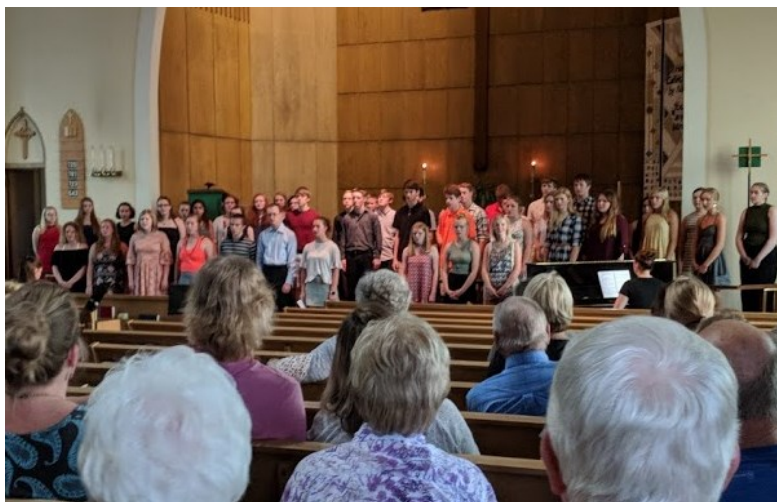
▲ Community Baccalaureate Service with two songs by the Spring Grove High School Senior Choir.