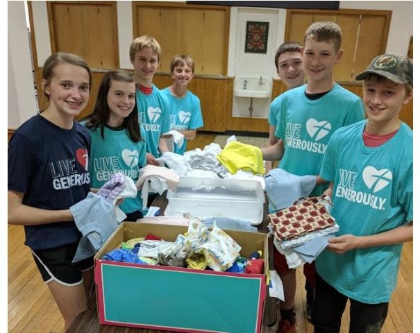
▲ Confirmation youth helped assemble school kits and layettes. A fun evening for all! ▼