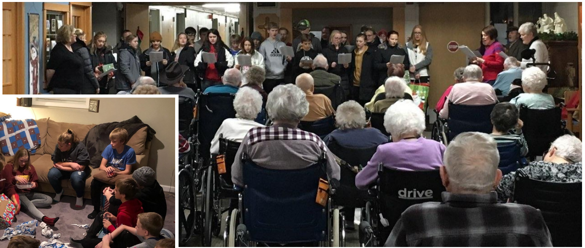
▲ Confirmation students sang Christmas carols at Tweenen Care Center and shared gifts with the residents.