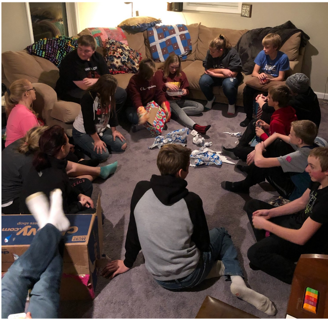
◀ High school youth met at Bekah's house for a Christmas party that included decorating cookies, eating, and games.