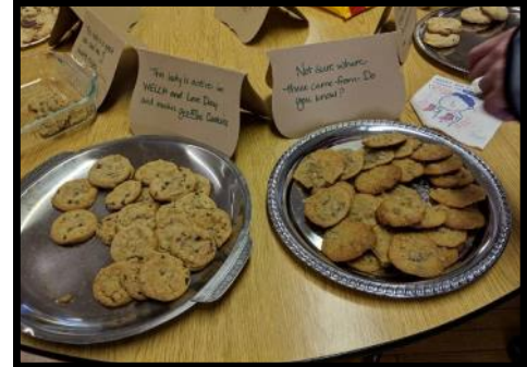
▲ A small sample of cookies from last year's Extravaganza.

Questions? Contact Lara Wold-Mendez, 507-450-6118, or Mary Zaffke, 498-5823.