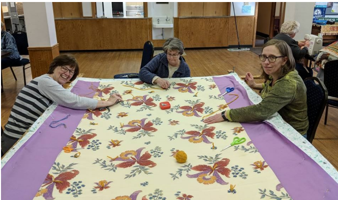
Love Day meets the fourth Friday of each month. ▲