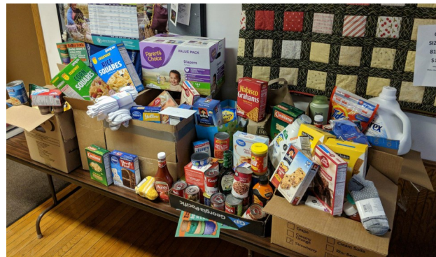
Just some of the items from the Reverse Advent Calendar donations. ▲