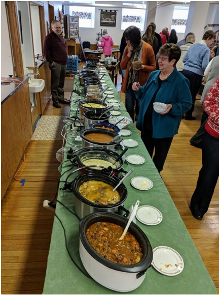
A delicious meal at the Empty Bowls event. ▲