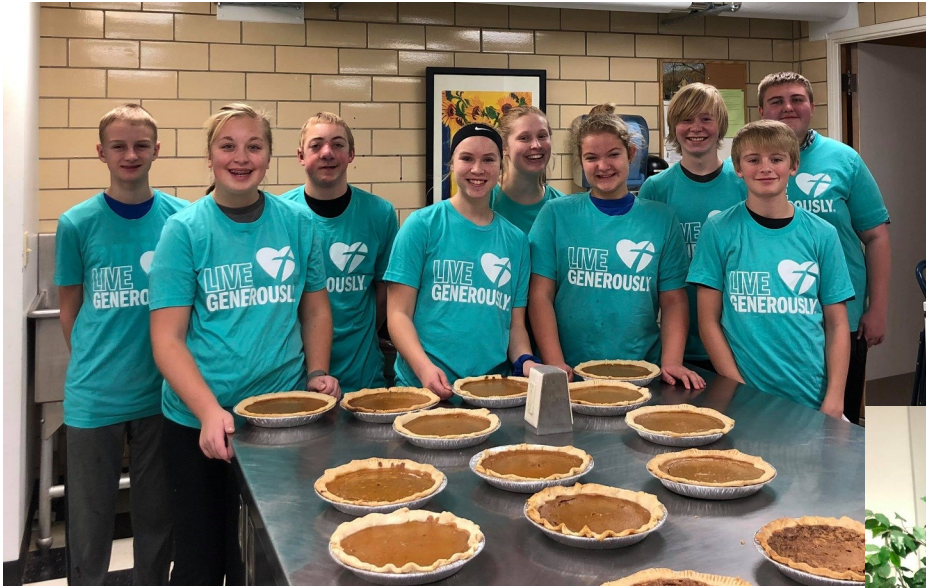
◀ Thanksgiving pies made by our youth. Yum!