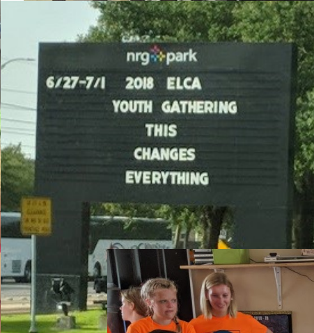
Just a few photo highlights from the ELCA Youth Gathering.... (clockwise from upper left) adult leaders, at the Mass Gathering, NRG Park sign, Service Day Book Fair, Galveston, riding the Metro