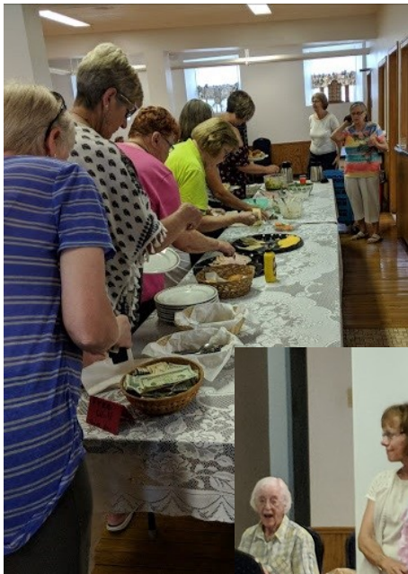
WELCA Summer Salad Luncheon and Auction